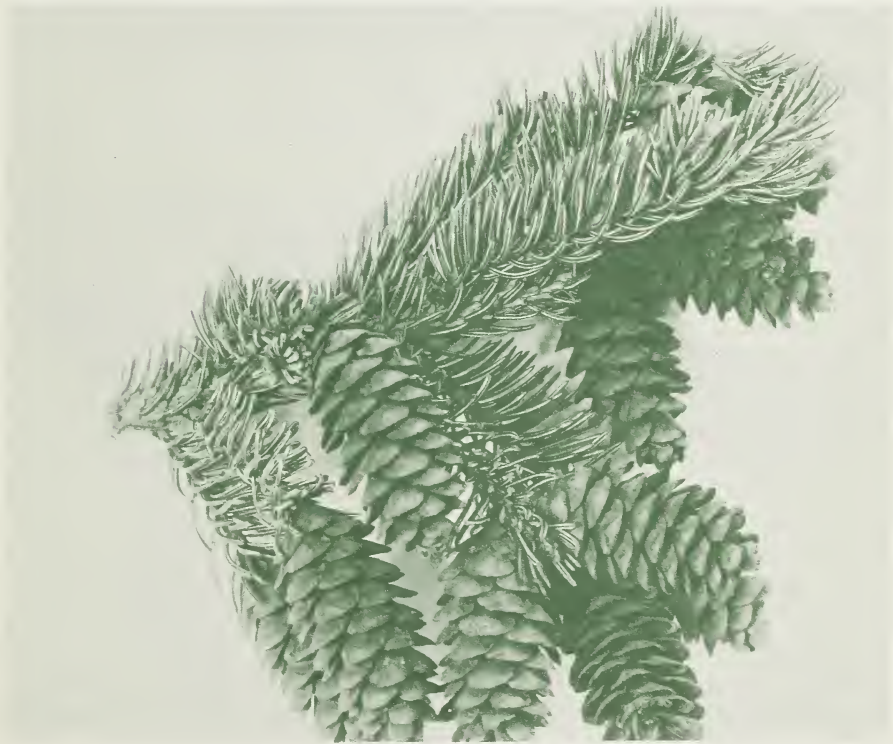
White spruce. (About three-quarters natural size)